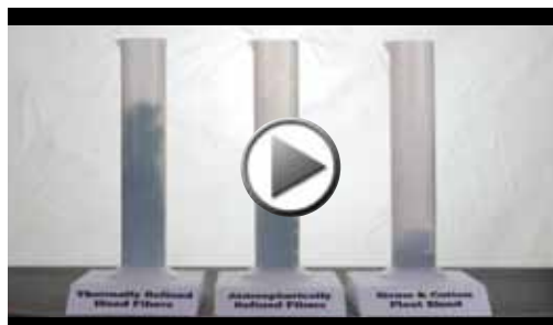
Greater loft equals greater coverage

In the real world: The increased volume of Thermally Refined wood fibers provides better soil surface coverage and loft for outstanding erosion control, seed germination and plant establishment.