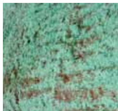
Applied at same rate

The photos above illustrate the 30% yield advantage of Conwed Fibers—both bowls contain 14 grams.