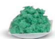
Thermally Refined Wood Fibers