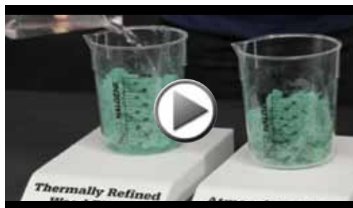
50% more water-holding capacity

«This graph shows that Thermally Refined wood fiber holds 13.5 times its weight in water. Atmospherically refined wood fiber has up to 50% less water-holding capacity.